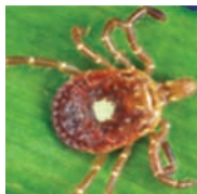
Lone star tick