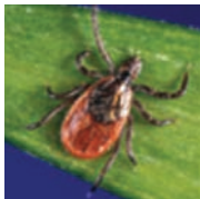
Black-legged “deer” tick