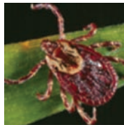
American dog tick