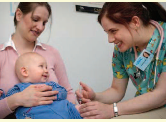
Information for Healthcare Providers